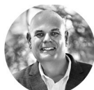
Martin Newell Rural & Lifestyle Property

Call 0429 883 488 for your free appraisal